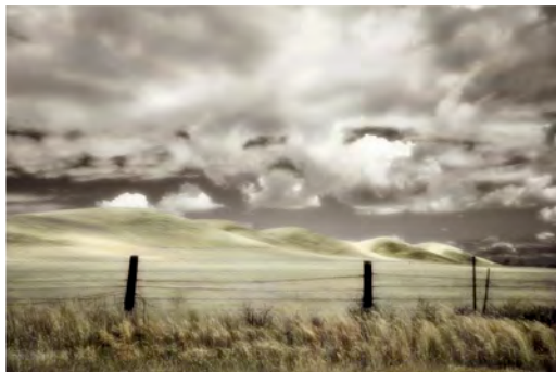
PanPastel Hand-Colored Ink-Jet Photographic Print PhotoArtistryWorkshop.com Dianne Poinski "Illuminated"

3. Using a Softt Tool e.g. Applicator (63070), apply PanPastel color lightly to image, building up transparent layers.