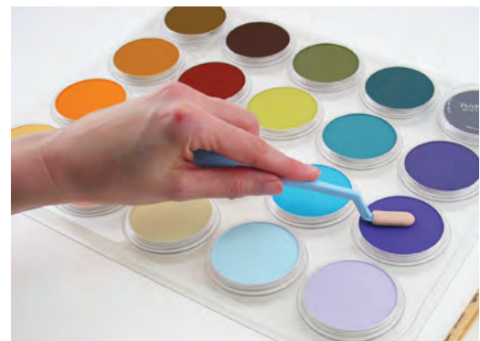
PANPASTEL COLORS Apply Pastel Color Like Paint

Contrast Blending (gradation) Atmospheric Perspective