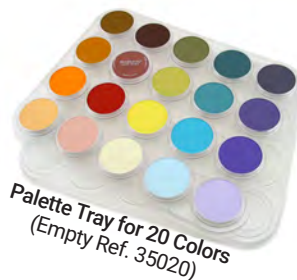
Palette Tray for 20 Colors (Empty Ref. 35020)