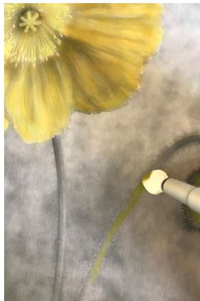
Using the tip of applicator to fill in the stem with Bright Yellow Green Shade.