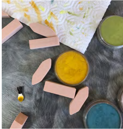
Materials list is provided on page 1.