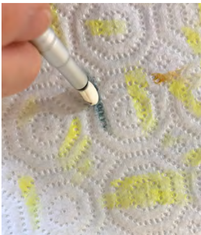
Using the tip of the applicator to remove excess Turquoise Shade onto the paper towel.