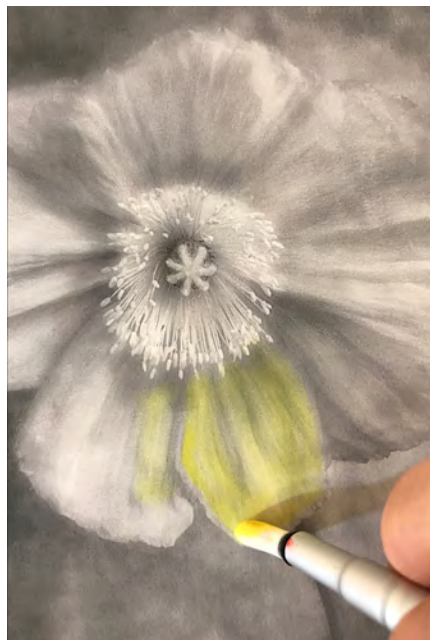
Using the tip of the applicator to carefully fill in color on the edge of the flower.