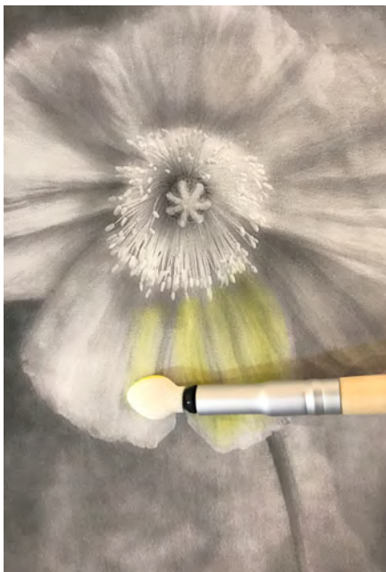
Applying Hansa Yellow with the applicator. Moving from the inside of the flower to the edge.