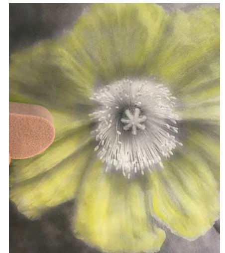
Using the sponge bar to blend color going from the inside of the flower to the edge.